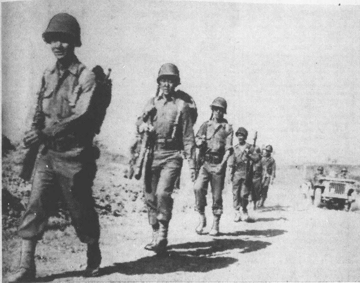
The U. S. Army Signal Corps caption for this radiophoto from the Italian front declares: "Japanese Americans, infantrymen of a Fifth Army division which played an important role in the current Italian offensive, walk along a road toward the front as they take part in the drive on Rome."