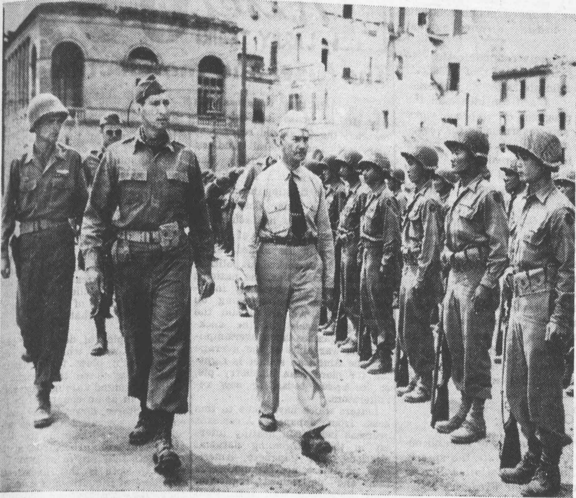
WITH THE FIFTH ARMY IN ITALY—In Italy on a tour of the front, Secretary of the Navy James W. Forrestal, accompanied by Lieut. Gen. Mark W. Clark, Fifth Army Commander, inspects troops of the 100th Infantry Battalion, composed of Americans of Japanese descent. The Japanese Americans were present as a guard of honor for the Navy secretary.