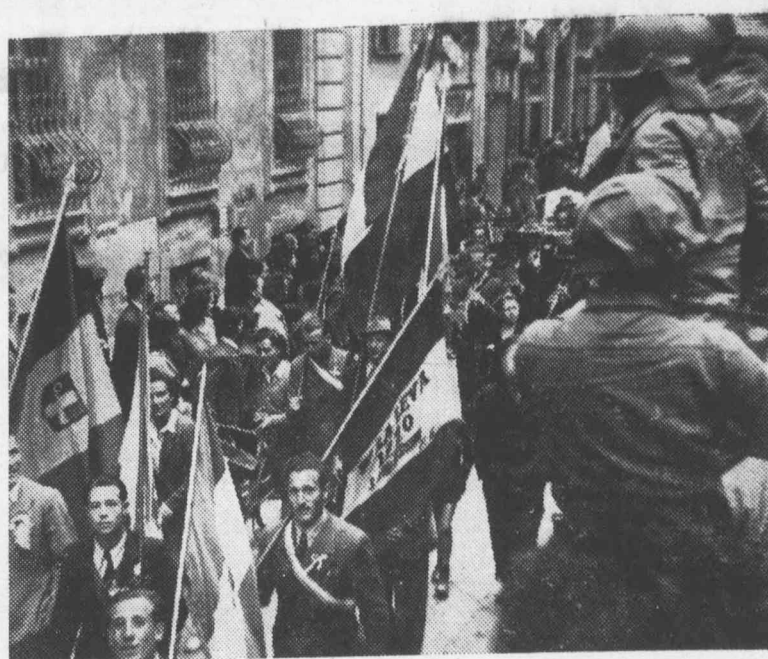
GENOA, Italy—Celebrating Italian Partisans shown above with banners and flags greeted incoming Nisei troops as they entered Genoa late in April, 1945. The 442nd moved into the city, liberating it shortly before the end of the war. Three figures to right are Nisei combatmen on trucks riding into the port city.