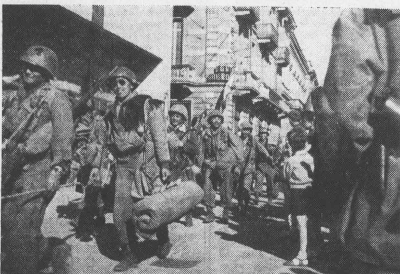
NAPLES, Italy—Troops of the 442nd shown entering Naples shortly after debarking on May 30, 1944, from the United States.