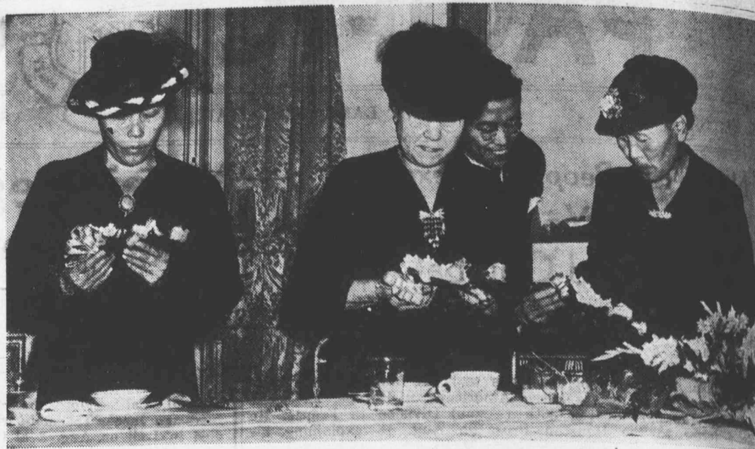
PORTLAND, Ore.—Gold Star mothers, whose Japanese American sons in the U. S. Army were killed in battle during World War II, were honored at the JACL's testimonial banquet at Hotel Multnomah on Aug. 11. Here three of the moth-