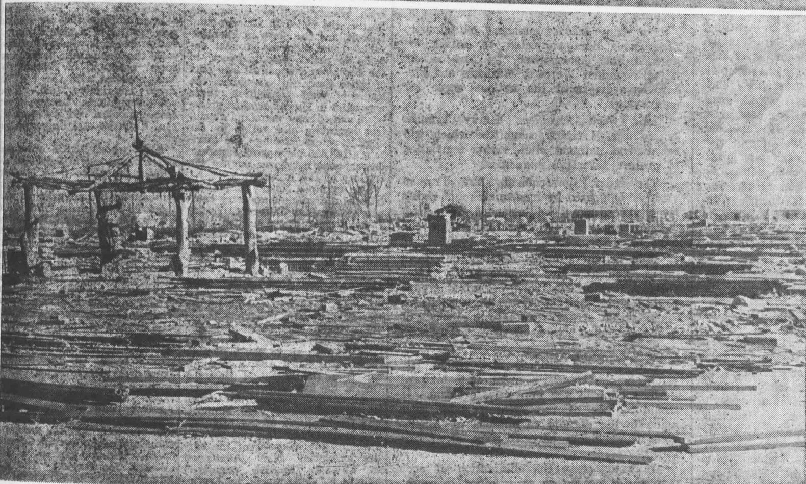
(Top) Manzanar relocation center, one-time home of 8,000 evacuees of Japanese ancestry, is shown bleak and deserted against a background of high Sierras. (Lower) The Manzanar camp is shown as it looked this week

after it had been dismantled to provide lumber, wiring and other necessities for war veterans housing. The long barracks buildings were sold to veterans for $333.13 by the War Assets Administration—Photos courtesy of Los Angeles Times.