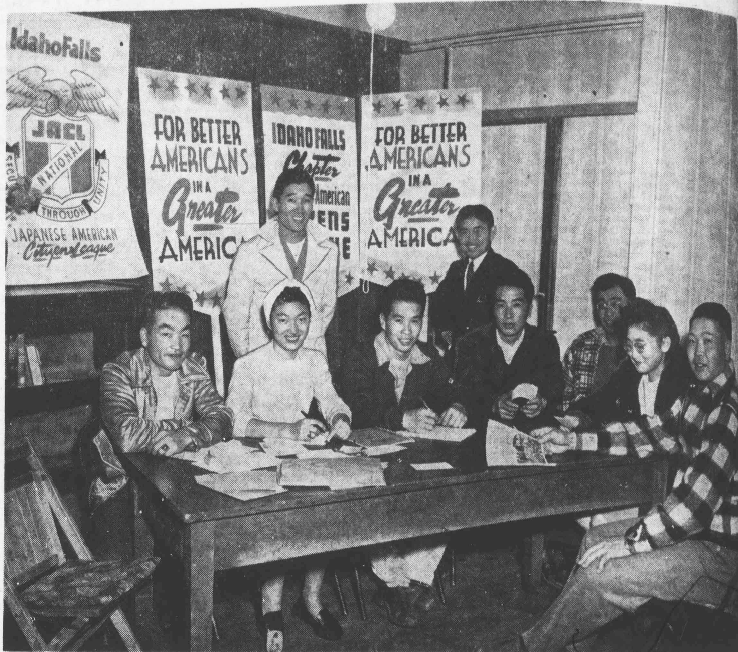
IDAHO FALLS, Ida.—Committeemen of the Idaho Falls JACL are shown above as they make preparations for the Intermountain district council convention to be held Nov. 28 and 29 in that city.