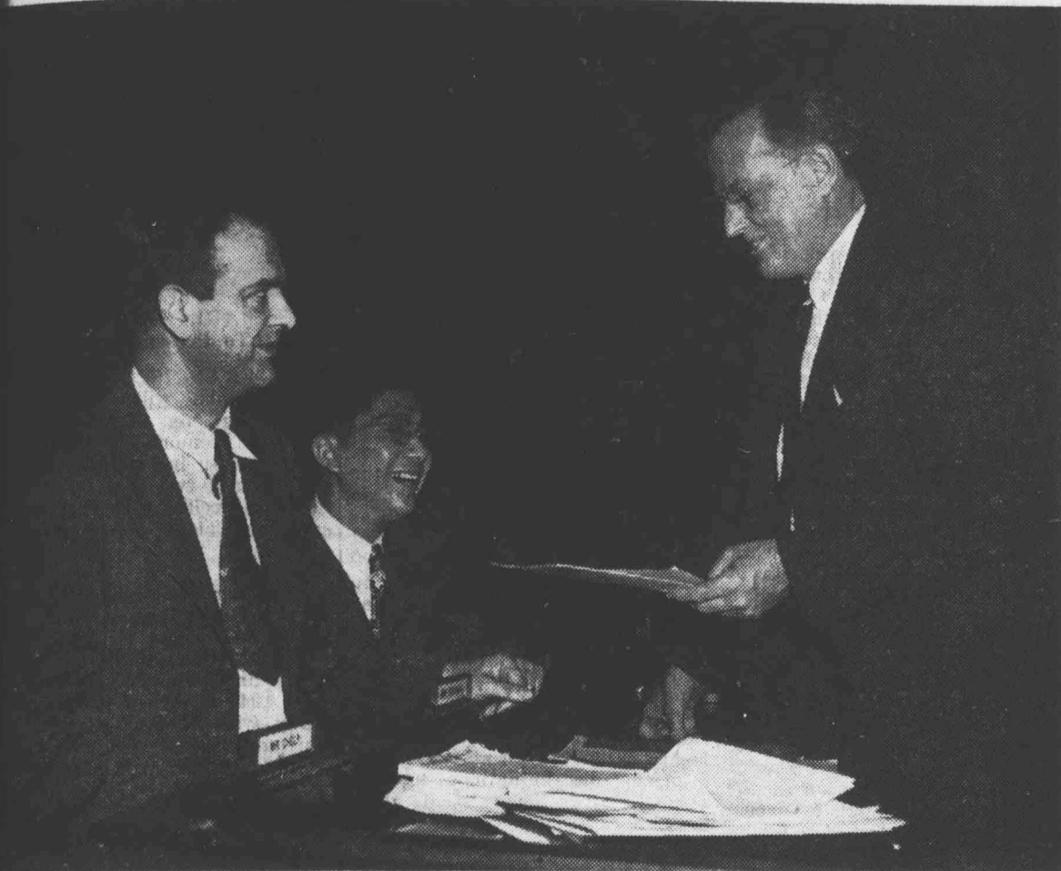
During last week's hearings of the House Judiciary subcommittee in Washington, D. C., on H.R. 5004, the bill which will remove racial restrictions from the naturalization law, Rep. Walter H. Judd, R., Minn., sponsor of the proposed