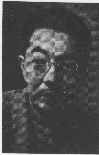
Dr. S. I. HAYAKAWA (above), president of the Chicago Consumers Cooperative, will be the main speaker at the May 6 meeting of the Chicago JACL.