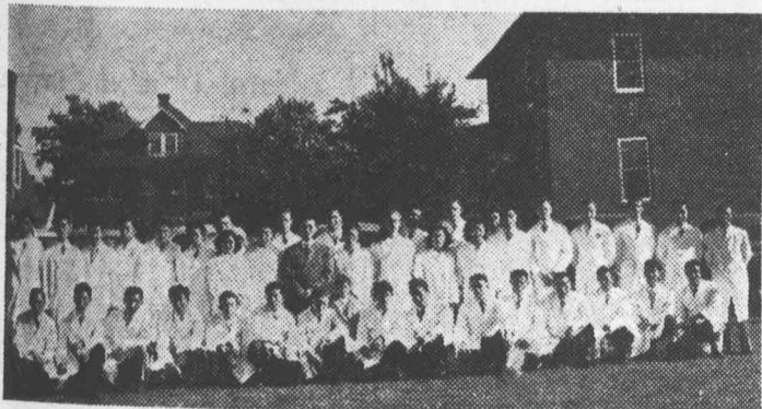
AMERICAN CHICK SEXING ASSOCIATION SCHOOL GRADUATING CLASS, FALL OF 1947

Phone 66 E. 4th So. St. 4-8261 SALT LAKE CITY