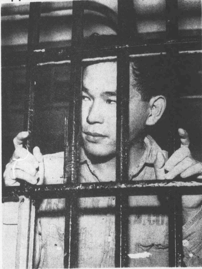
Tomoya Kawakita, sentenced to death following his conviction for treason, awaits the outcome of his appeal for review of the case by a higher federal court. Kawakita will remain in the Los Angeles county jail until the appeal action is concluded.