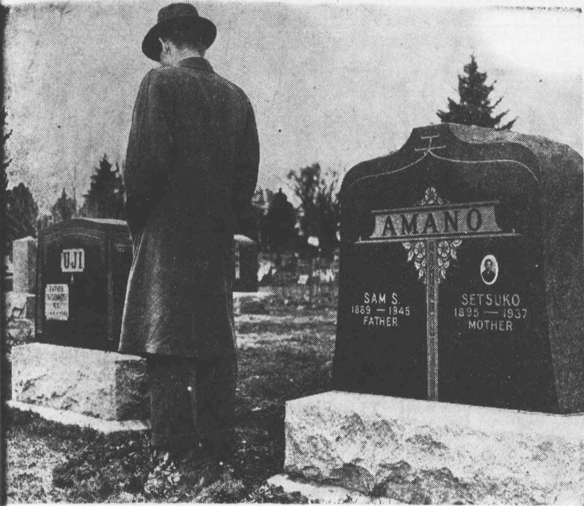
DENVER, Colo. — A visitor to Crown Hill cemetery, which recently barred the burial of a Nisei veteran, pauses to study the inscriptions on the monuments placed in memory of persons