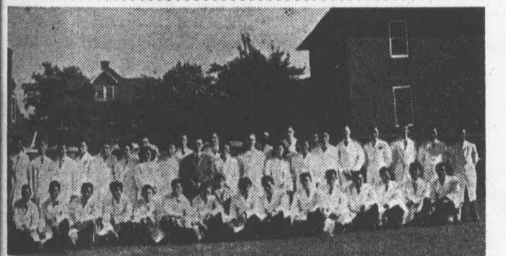
Part of the school-trained American Chick Sexing Ass'n staff.

WOOLENS FOR MEN and WOMEN'S WEAR — for — Suits, Coats, Slacks, Skirts, Dresses, Robes, etc. Sold by the Yard Write for Samples Stating Material and Color Desired ALEXANDER BRICK 728 South Hill Street, Los Angeles 14, Calif., U.S.A.