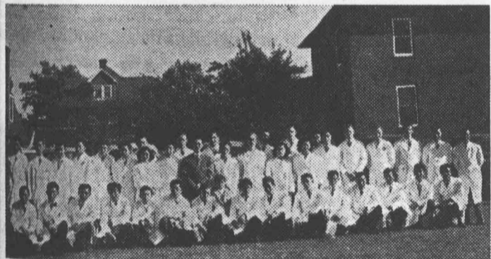
Part of the school-trained American Chick Sexing Ass'n staff.

728 South Hill Street, Los Angeles 14, Calif., U.S.A.