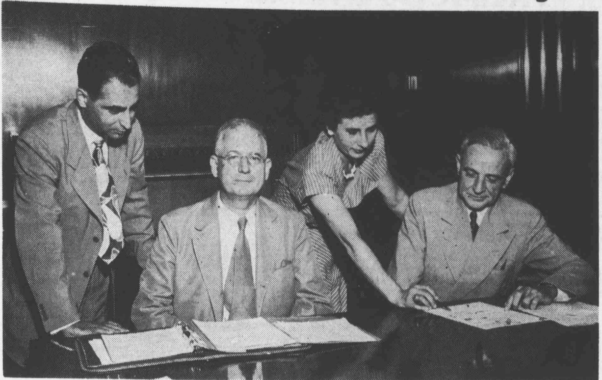
Department of Justice officials in charge of evacuee claims program in the Los Angeles area discussed claims problems at a special meeting called in Los Angeles last week by the Pacific Southwest office of JACL ADC. The first field office for evacuation claims is scheduled to open in Los Angeles this week.