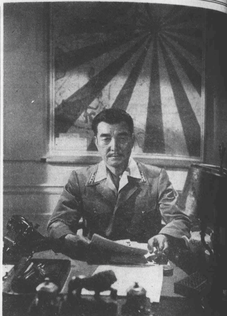
Word from Hollywood is that Sessue Hayakawa, famous silent screen star who is now making a comeback in Hollywood, may be nominated for a "best supporting actor" award by 20th Century Fox for his performance