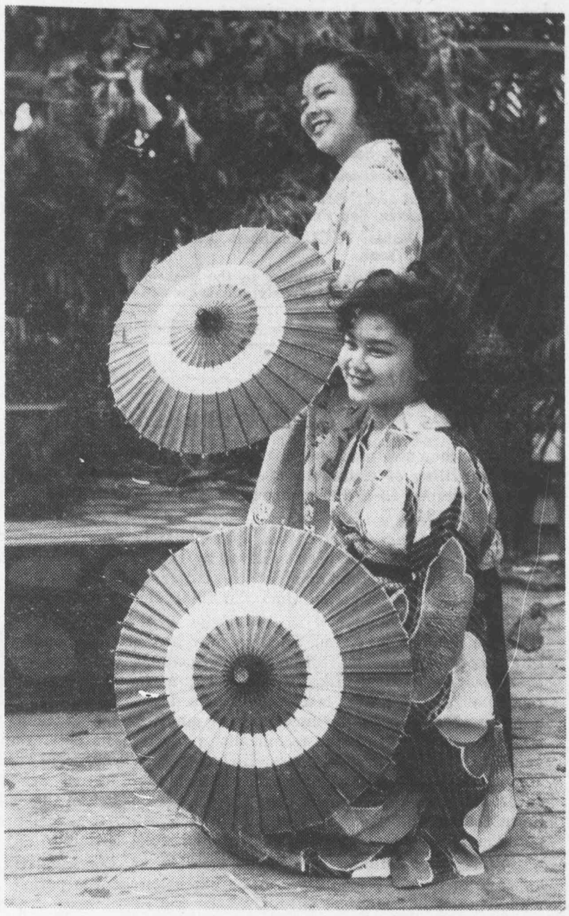
The "melting pot" theme of the annual Aloha Week celebration in Hawaii was shown to brilliant advantage by the colorful costumes worn by the participants. These Hawaiian girls of Japanese ancestry donned the costumes of their ancestors during the festival.