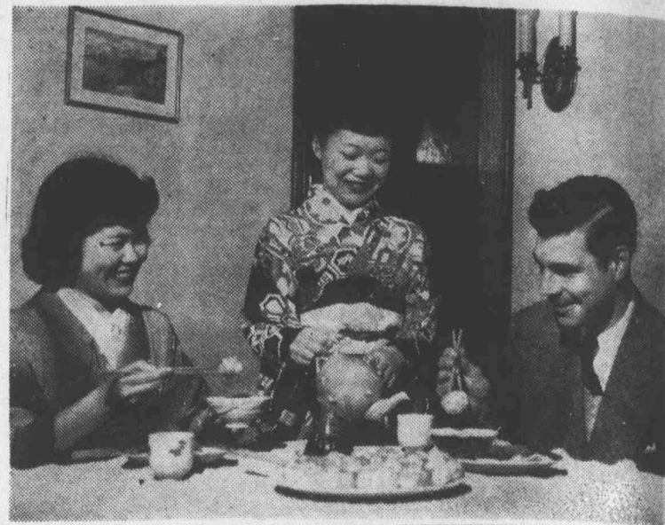
JACL CHOPSTICK SMORGASBORD — The Twin Cities United Citizens League sponsored a Japanese culture night at the St. Paul International Institute last week, including in its program a sukiyaki dinner and a kimono display.