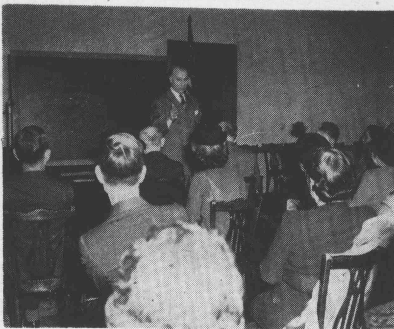
CLEVELAND, O.—In preparation for the day when they may obtain US citizenship, approximately 80 Issei of Cleveland have enrolled in a newly formed citizenship class which was initiated by the Cleveland JACL.