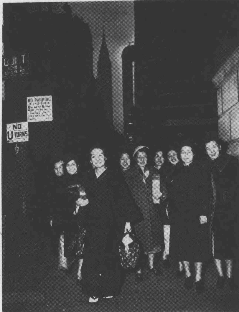
Members of the delegation of Japanese women leaders who recently visited New York City are shown sightseeing on Lexington avenue in downtown Manhattan. The Chrysler building spire is in the background.

He represents the fuller participation in civic affairs that is the aim of the Japanese American group which is generally limited to political expression through the ballot.