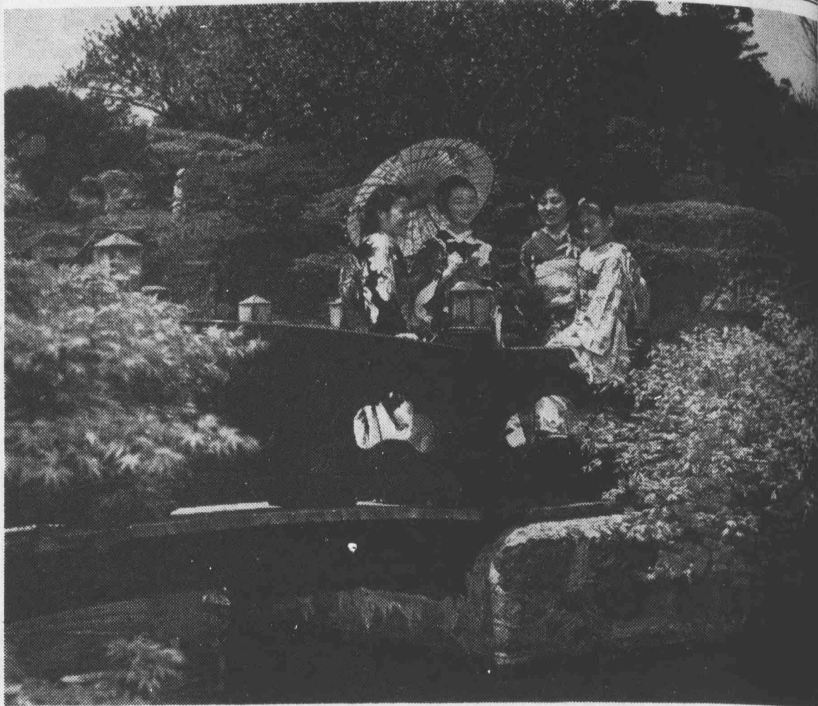
NEW YORK CITY—Four Nisei girls active in the current youth campaign for the Japan International Christian university foundation pause to rest in the famous Japanese garden at Brooklyn's botanic garden.