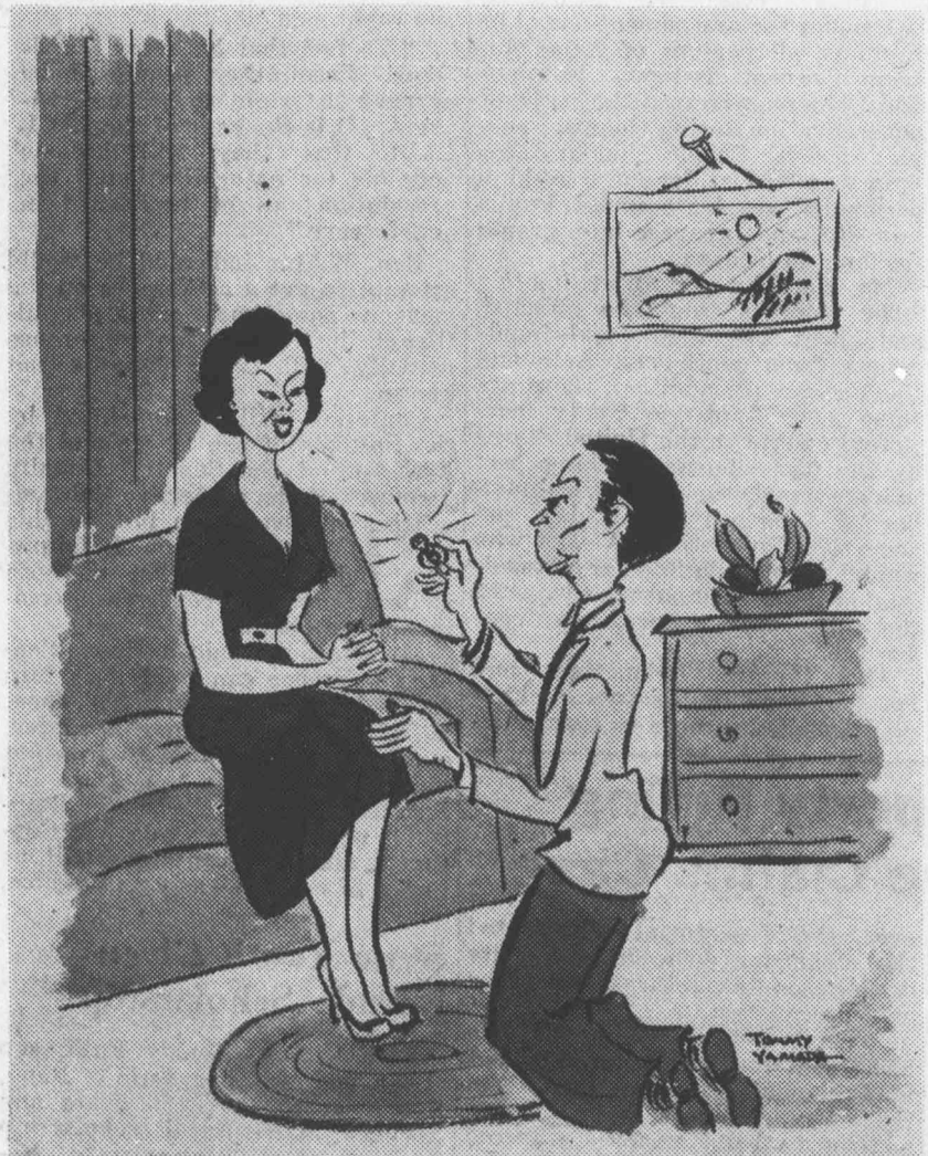
"Yes . . . If you promise to take me to the JACL convention in Chicago."