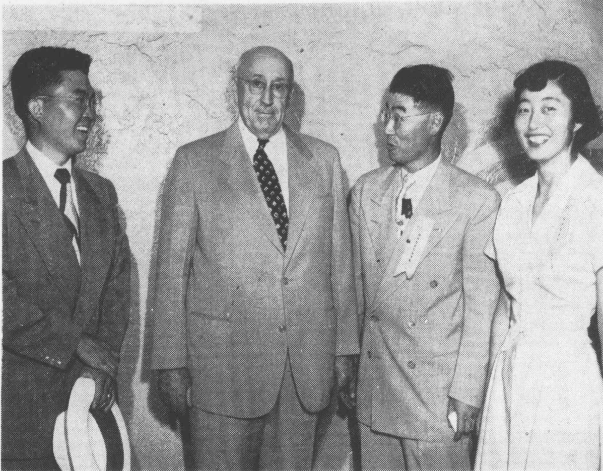
Three Utah officials of JACL groups attended the Utah State Democratic party convention in Salt Lake City on July 29 where they thanked Sen. Elbert D. Thomas of Utah for his support of the Walter resolution for equality in naturalization. Sen. Thomas, who was renominated by the Democratic party, is