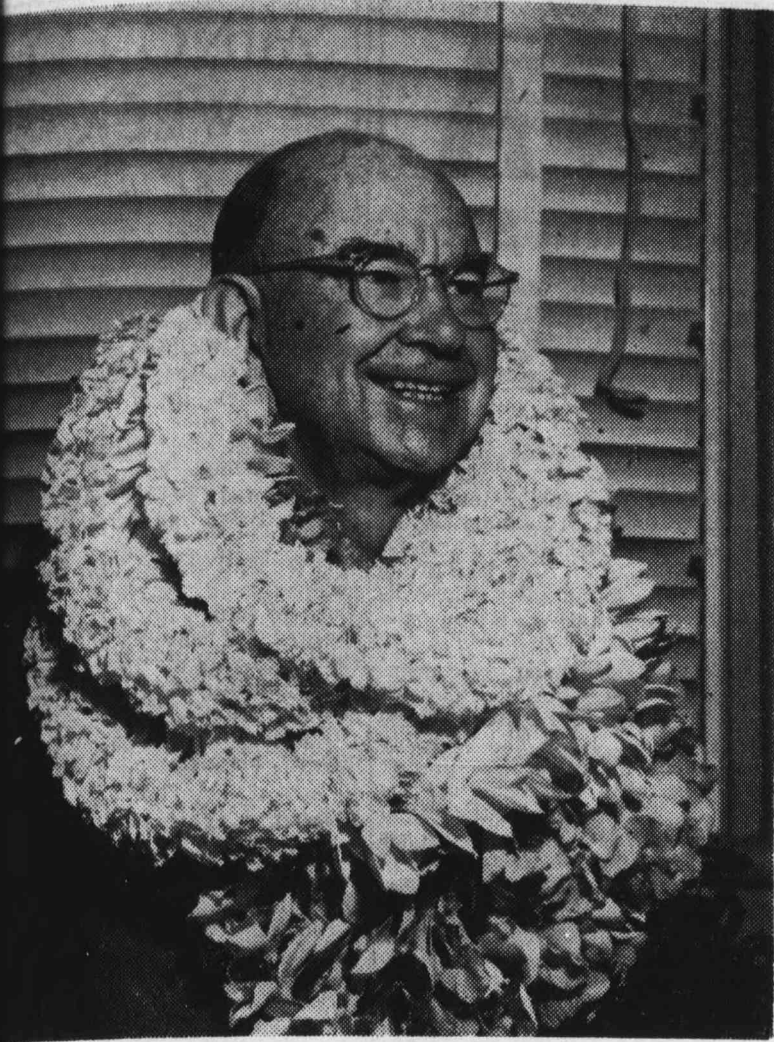
Oren E. Long, 10th Hawaiian governor.