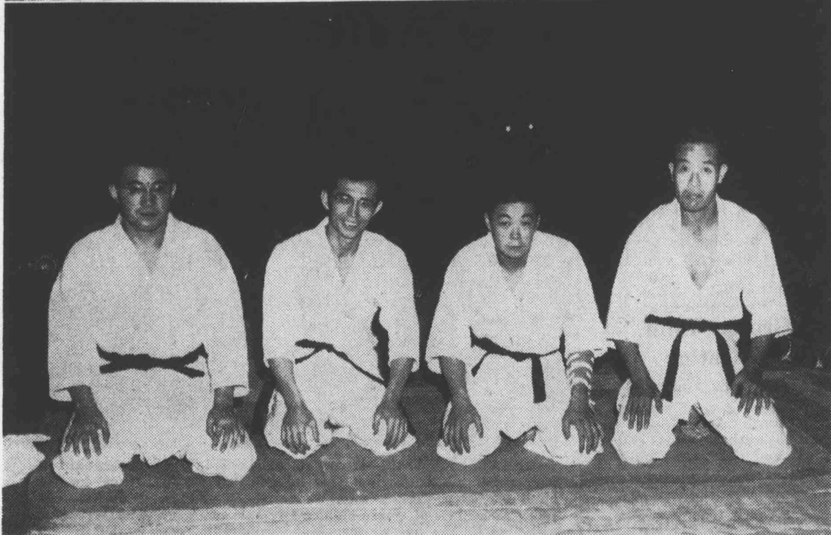
DETROIT, Mich.—Nisei participated in the 250th birthday celebration of the city of Detroit with dance and judo exhibitions.

Eight girls dressed in Japanese costume performed before 20,000 persons in an international folk arts program at Belle Isle Shell on the evening of July 27.