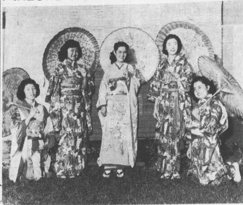
PHOENIX, Ariz.—These girls were among 17 Nisei and one Japanese war bride who participated in the Days of Nations Festival June 12 at the Encanto Park Bandshell.

More than 3,000 spectators watched the colorful dances of 14 national groups.