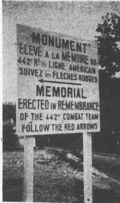
This sign directs the visitor to the JACL-sponsored memorial

Bruyeres hasn't forgotten the Nisei and it's