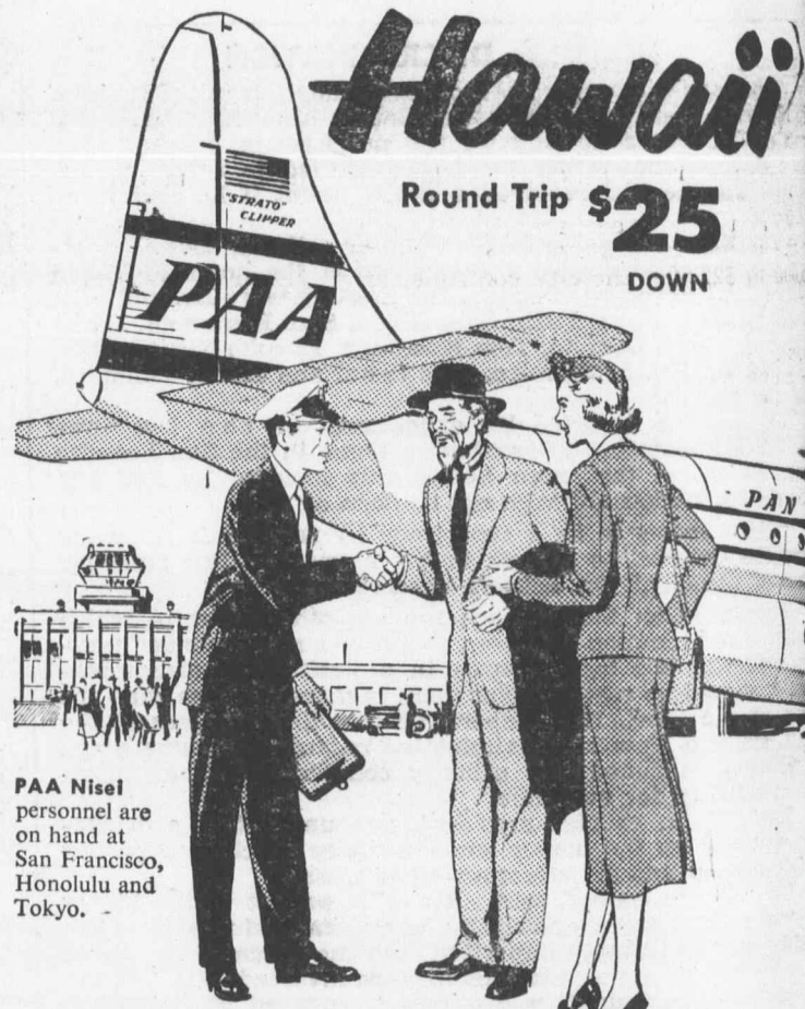
PAA Nisei personnel are on hand at San Francisco, Honolulu and Tokyo.

Small 10% down payment gets you a round-trip Clipper* ticket on the original Pan Am "Pay-Later" Plan! Pay the balance in up to 20 monthly installments.