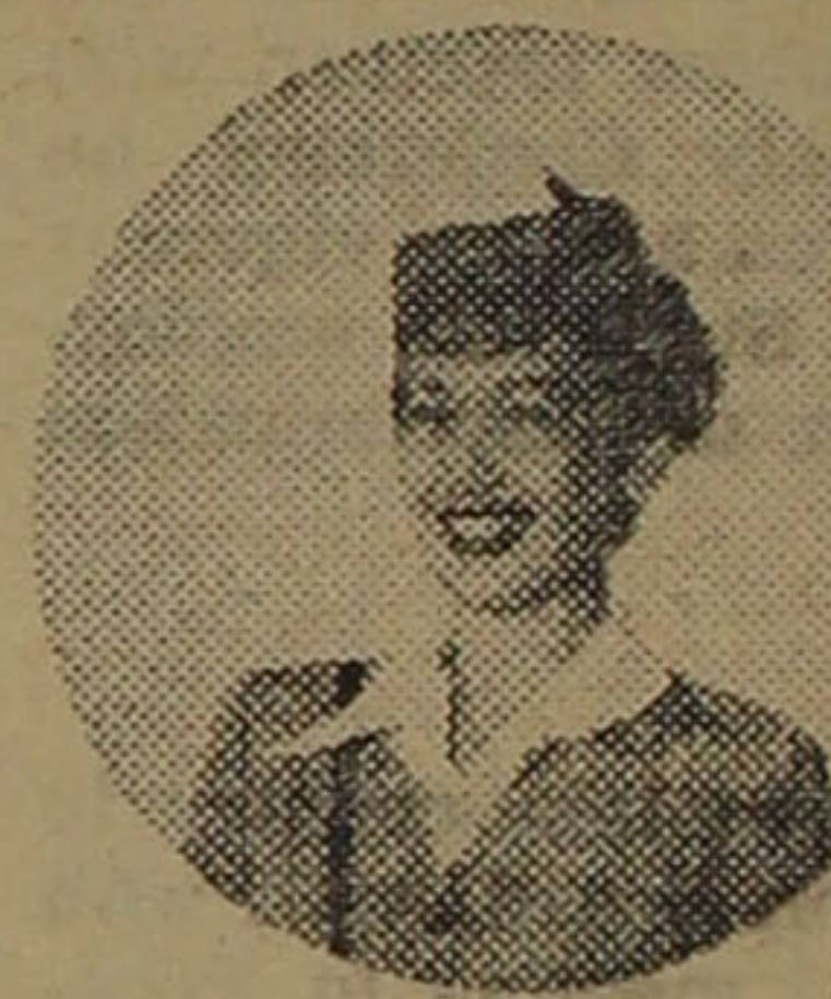
Nisei personnel enroute to assist you.