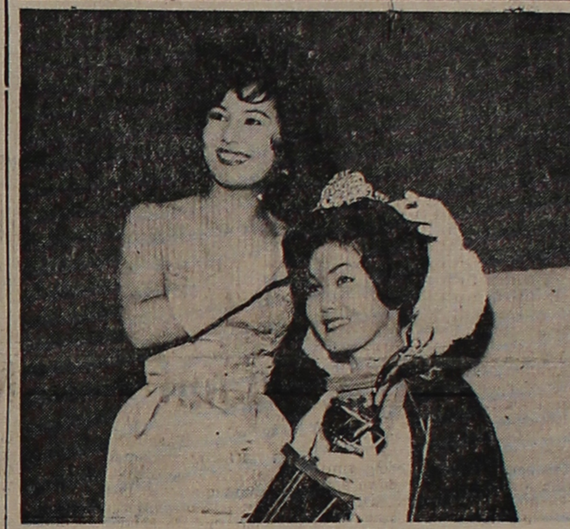
NISEI WEEK QUEENS: 1960 AND 1961

Since these repayments are from the governments of Germany and Japan, the JACL declared, that their use for the payment of war claims and monetary return of private vested property would not violate any constitutional concepts while reaffirming traditional principles of private property sanctity.