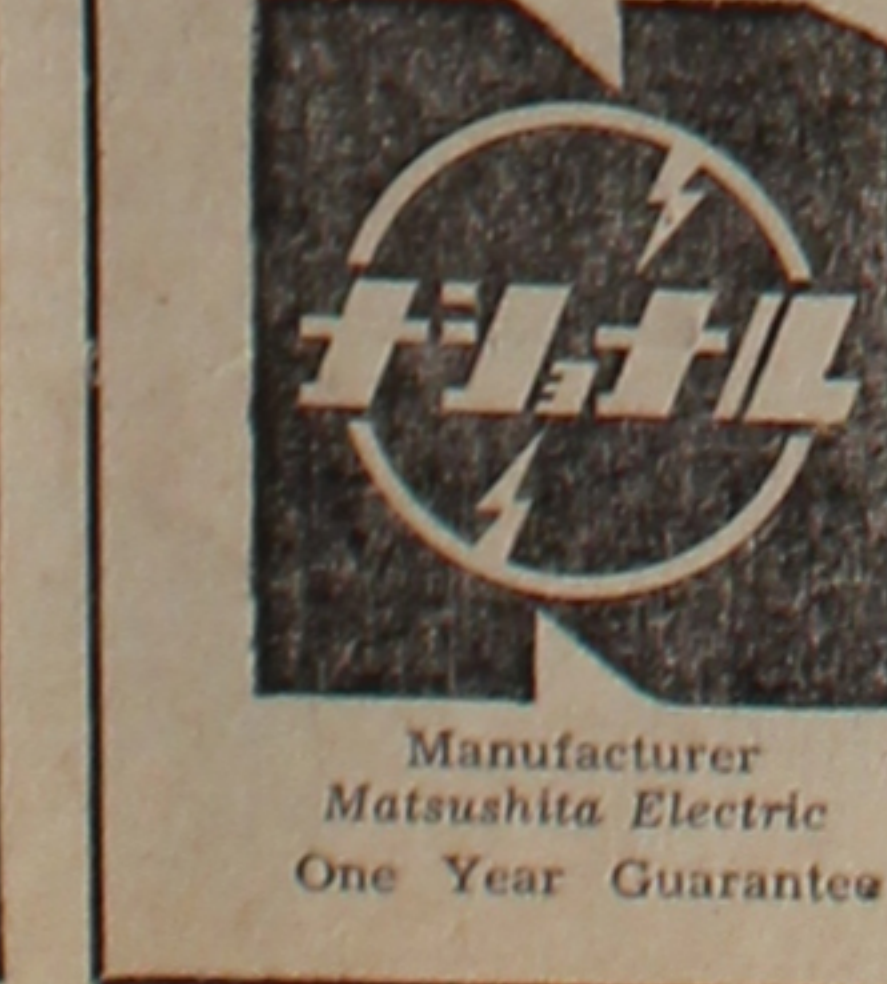
Manufacturer Matsushita Electric One Year Guarantee

With Detroit preparing to host the JACL National Convention in 1964, the Newsletter felt this group would be of age to organize itself as a Jr. JACL and contribute to the support of the convention program.