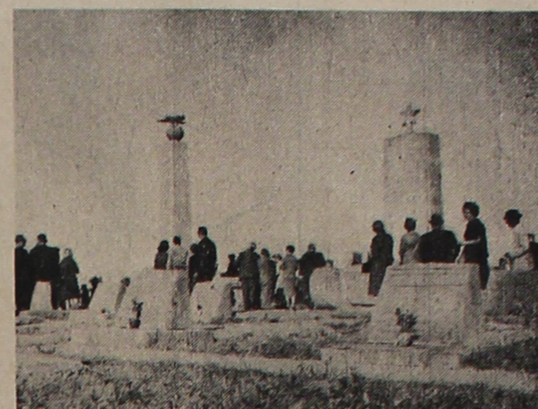
TWO MONUMENTS AT ROHWER