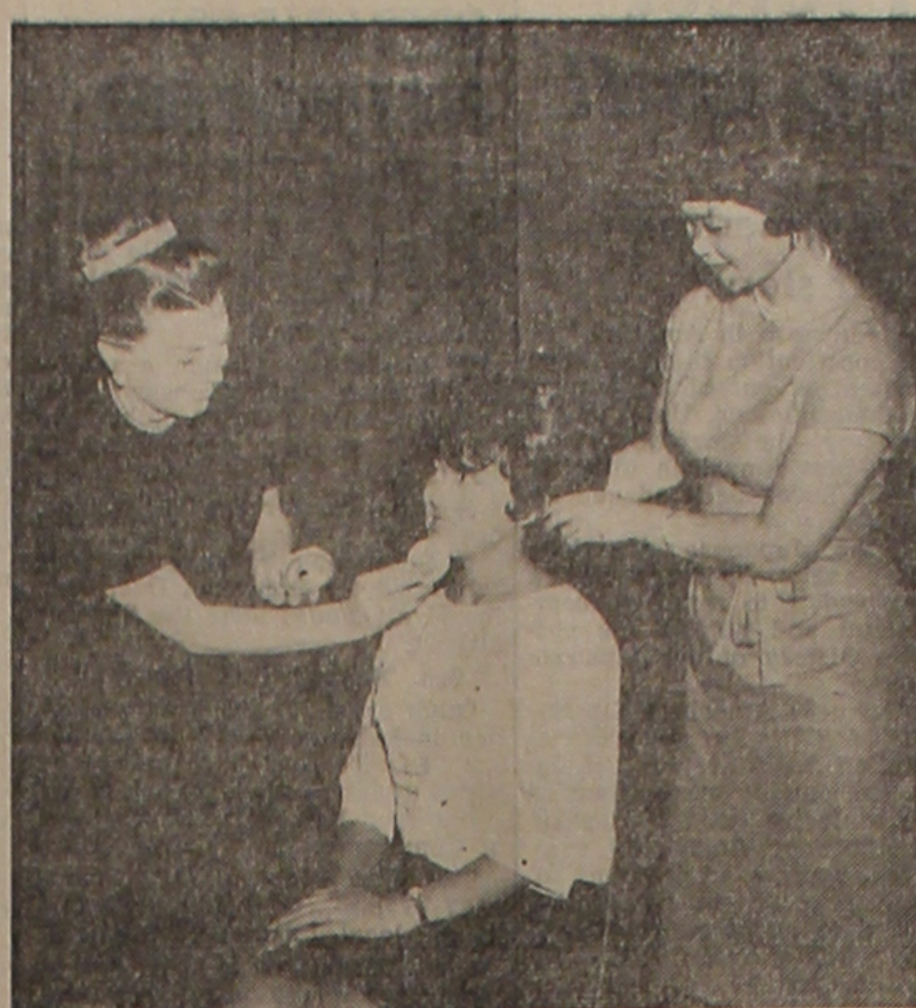
CHICAGO JR. JACL CHARM SCHOOL