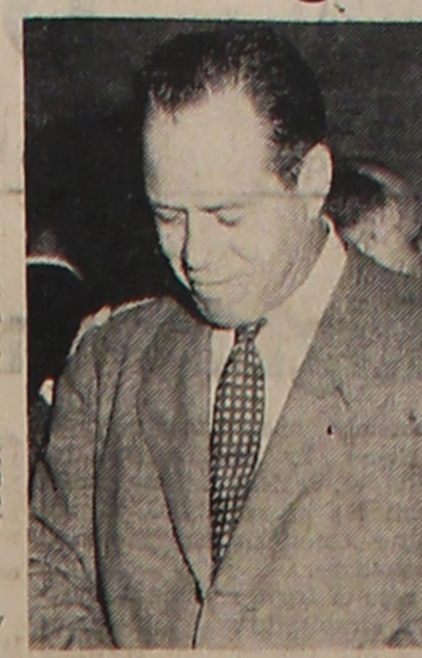
SEN. THOMAS KUCHEL