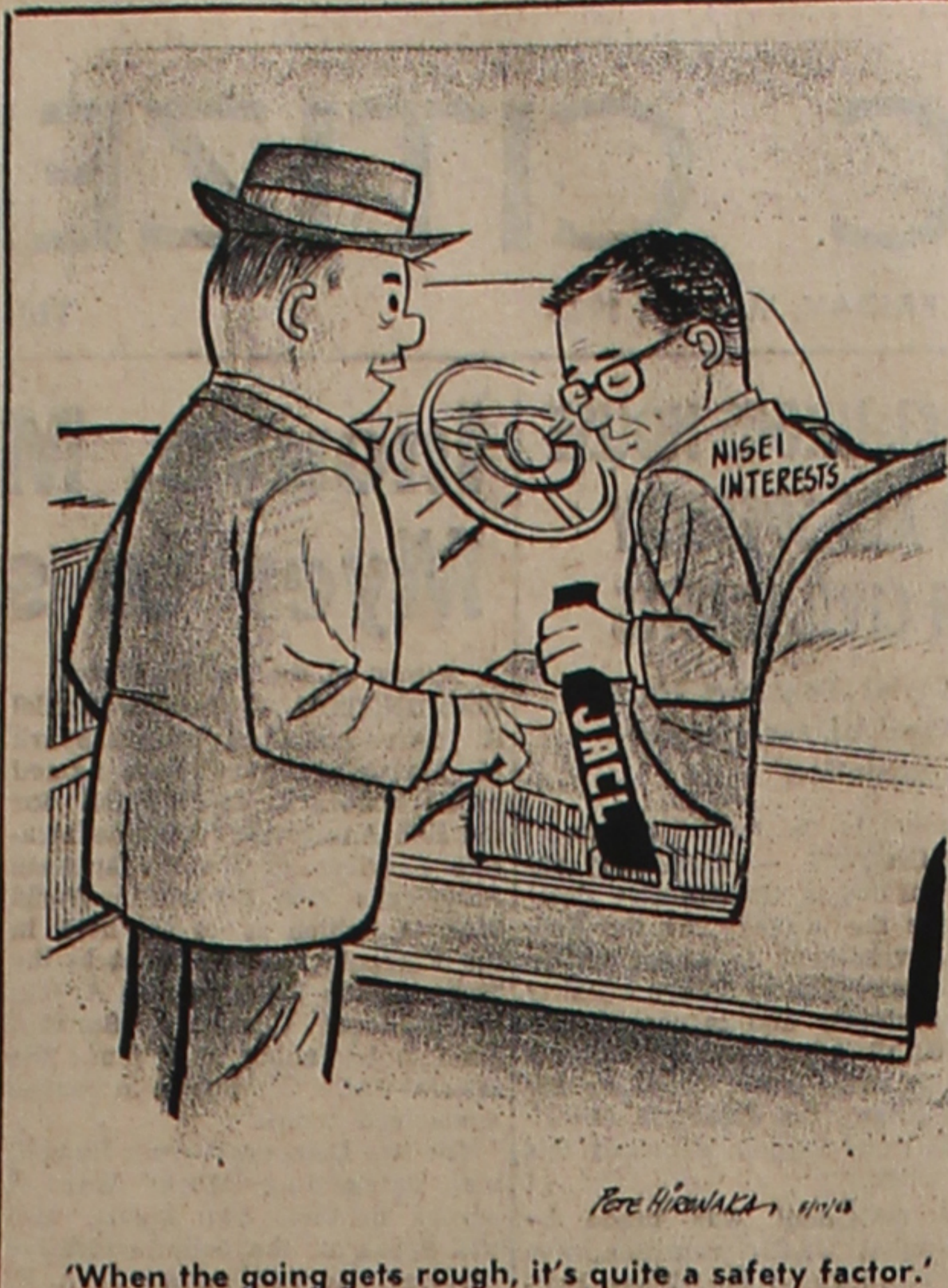
'When the going gets rough, it's quite a safety factor.'

Younger migrants FOR SPASTIC CHILDREN HONOLULU. — Hawaii's newest Japanese Women's Club presented the 20-29 age group, the State Economic Development Dept. revealed this past week.