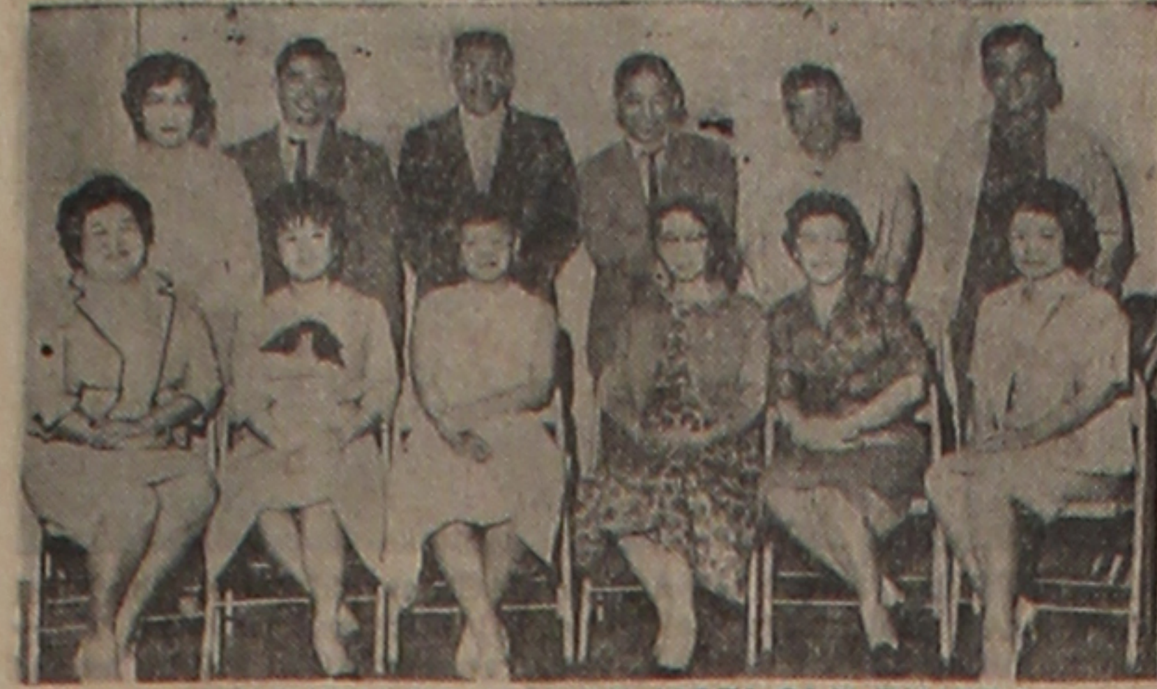
COMMUNITY TO HONOR ISSEI OLD-TIMERS San Jose area organizations are inviting area Issei, 75 years or older, to an appreciation dinner June 2 at the Buddhist Church Annex.