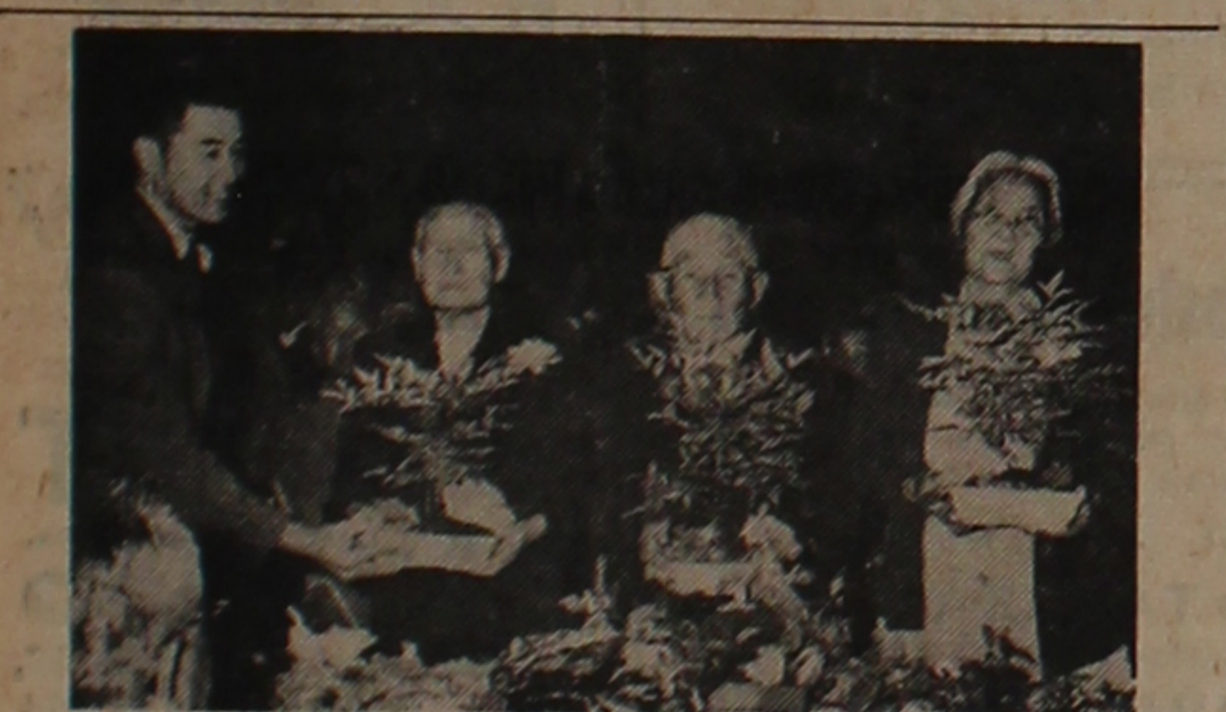
SAN JOSE HONORS THREE NONAGENARIANS