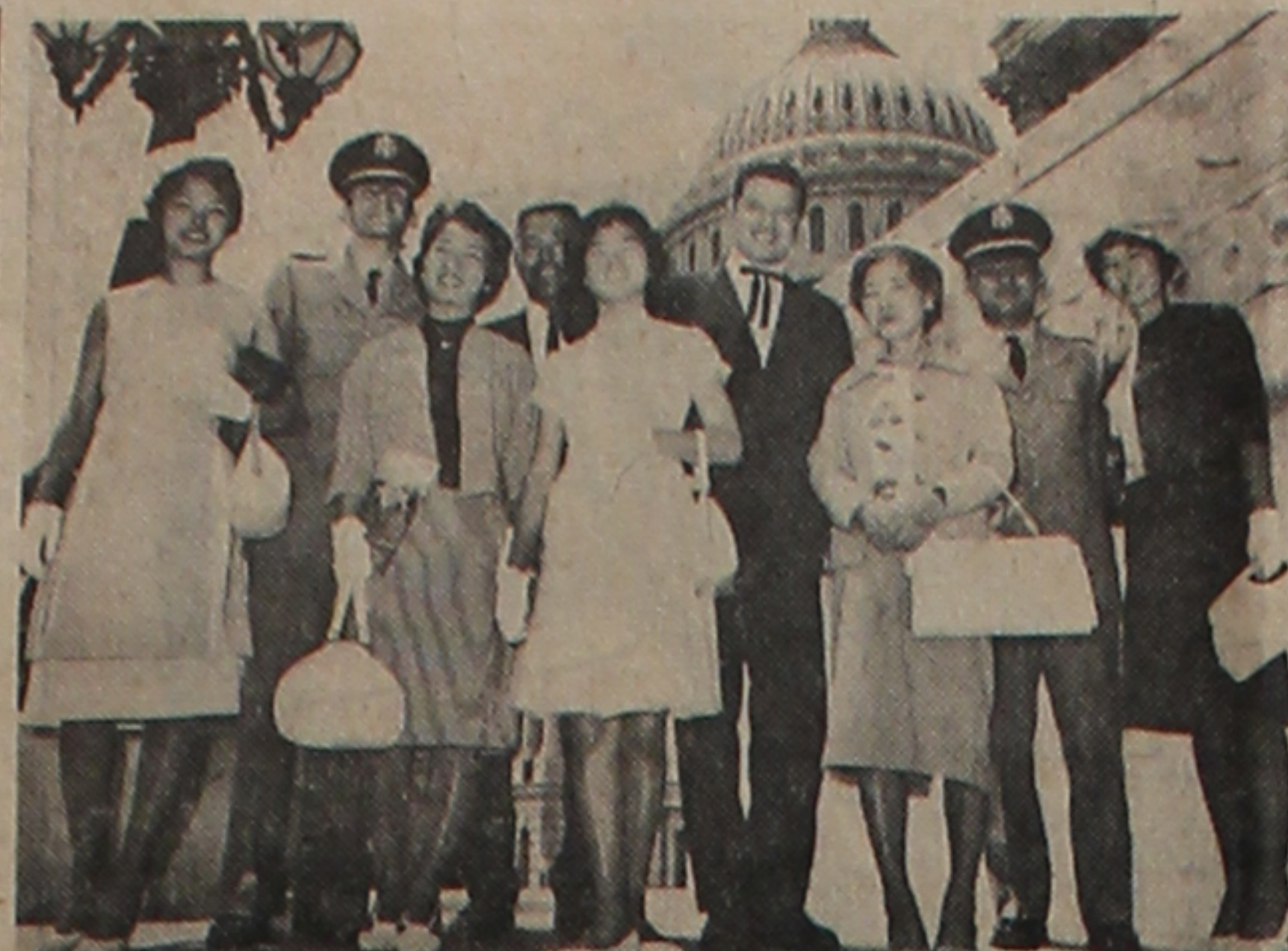
BOISE VALLEY JACLERS VISIT WASHINGTON

The Voice of America also gave us wonderful coverage. Its staff was with the JACL from the EDC's dinner Saturday night through Sunday. I understand that three programs of that weekend have already been broadcast to Japan. Full sound and pictorial coverage was made of the Sunday events by the Army for UARPA (U.S. Army of the Pacific) on a request from Schofield Barracks, Honolulu, Hawaii.