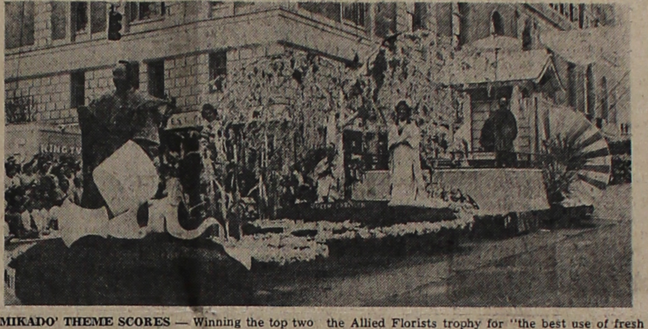
'MIKADO' THEME SCORES — Winning the top two prizes of the 1963 Seafair Week parade is the Japanese community float on the theme of Gilbert and Sullivan's operetta, "The Mikado". It won the King Neptune trophy for "the best in the parade" and the Allied Florists trophy for "the best use of fresh flowers". Tomorrow night in the torchlight parade, it will vie for the Queen's trophy for "the best by night" entry.