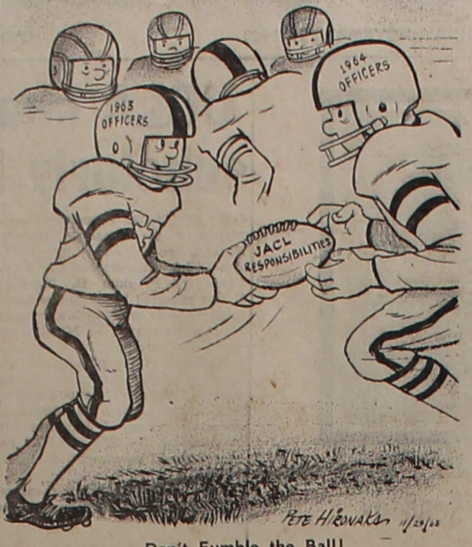
Don't Fumble the Ball!