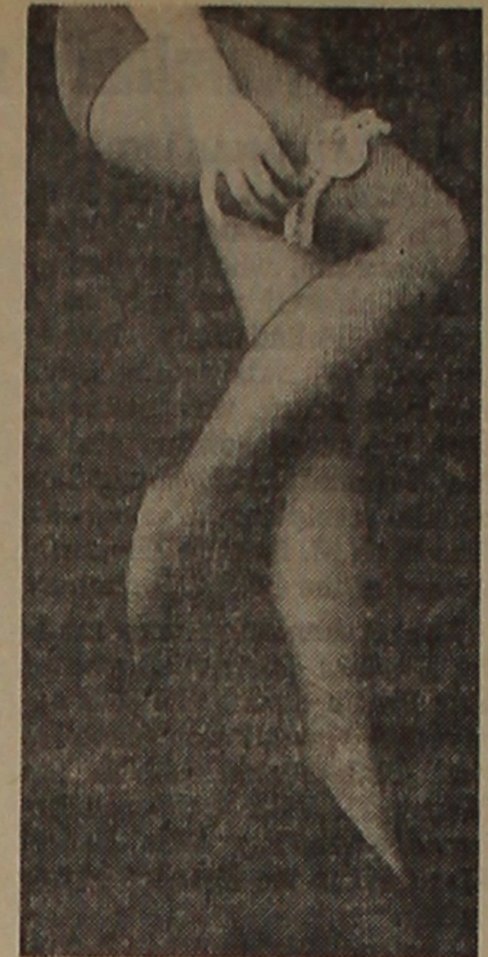
Keep your eye on the 1000 Club garter.

for this group will only be as great as you make it.