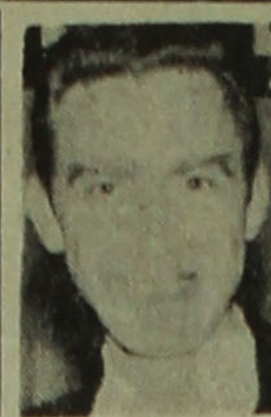
By Jim Henry

A total of 205 central govern- ment employees were pun- ished in fiscal 1968 for ac- cepting bribes, a 60 per cent increase over the previous year. Those punished for em- bezzlement increased by 13 to 212, while those punished for neglect of duty, including ab- sence without leave increased by 29 to 425. More than 10 per cent of ground beef and pork sold in Tokyo is still mixed with rabbit, horse, kan- garoo and other cheap meat, according to the Tokyo Metro- politan Health Bureau. Ugh!