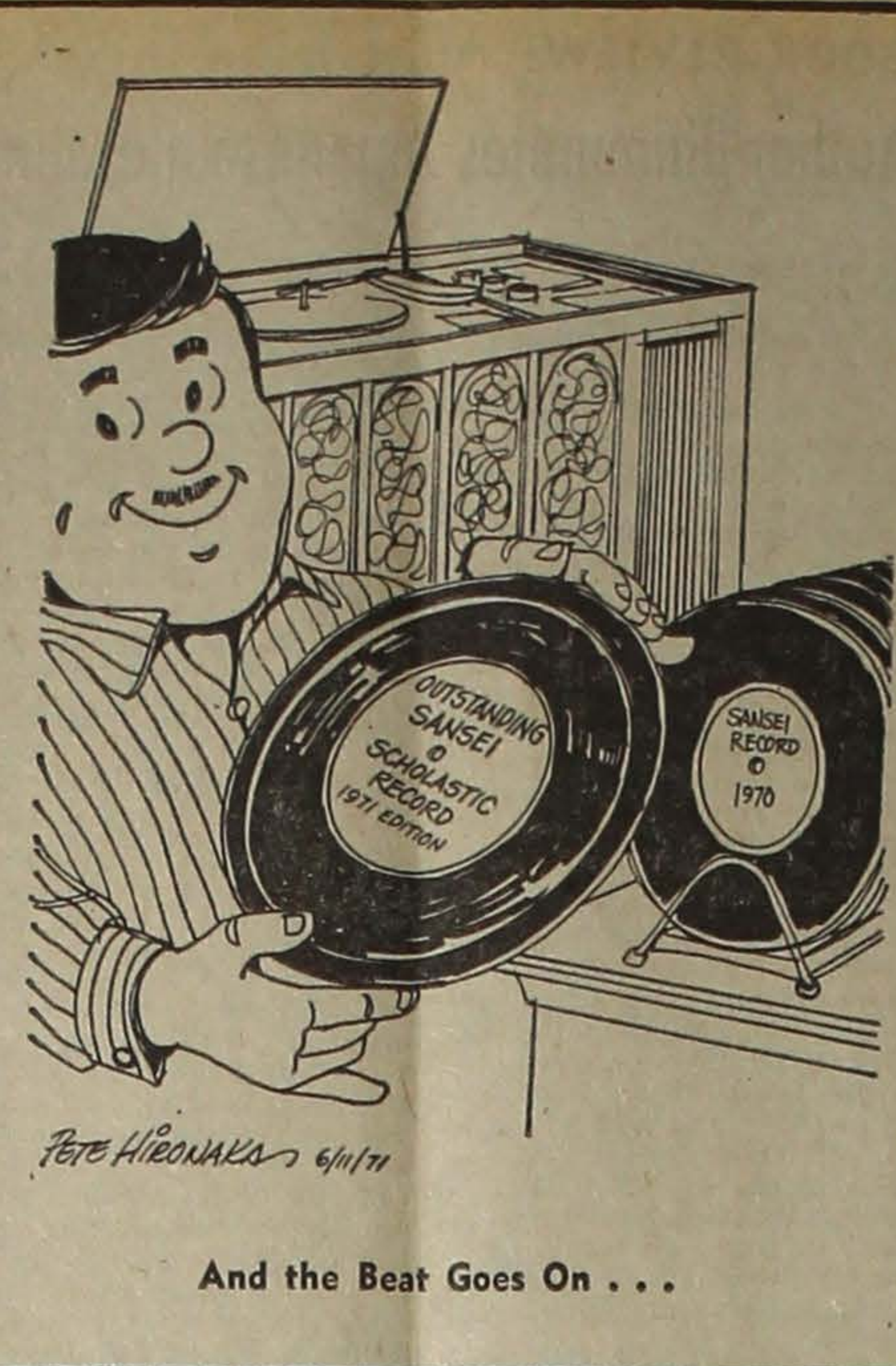
And the Beat Goes On . . .