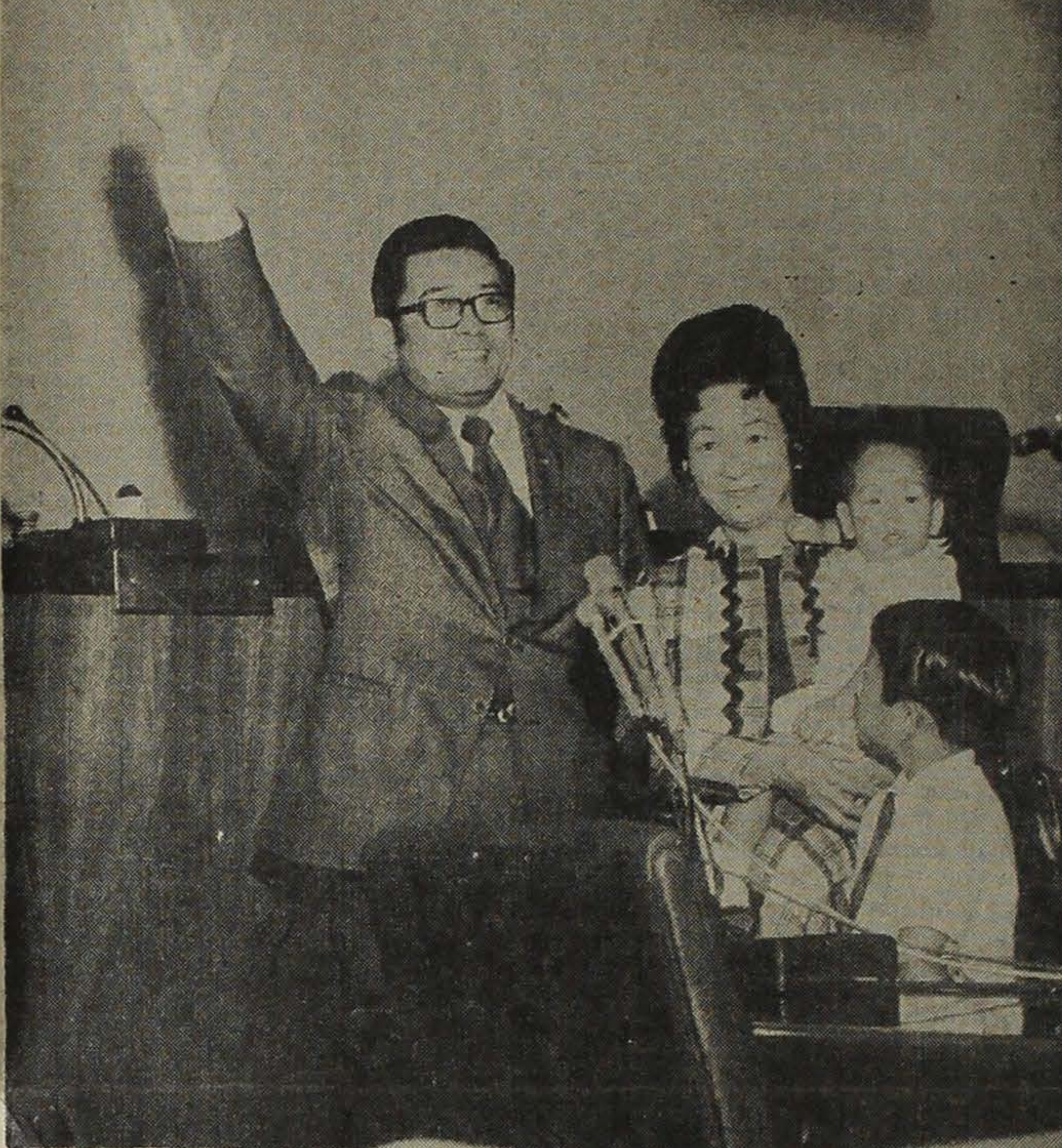
HIZZONER NORMAN—Newly-installed San Jose mayor Norman Mineta and family stand in the City Hall council chambers. Ceremonies took place June 30. With the