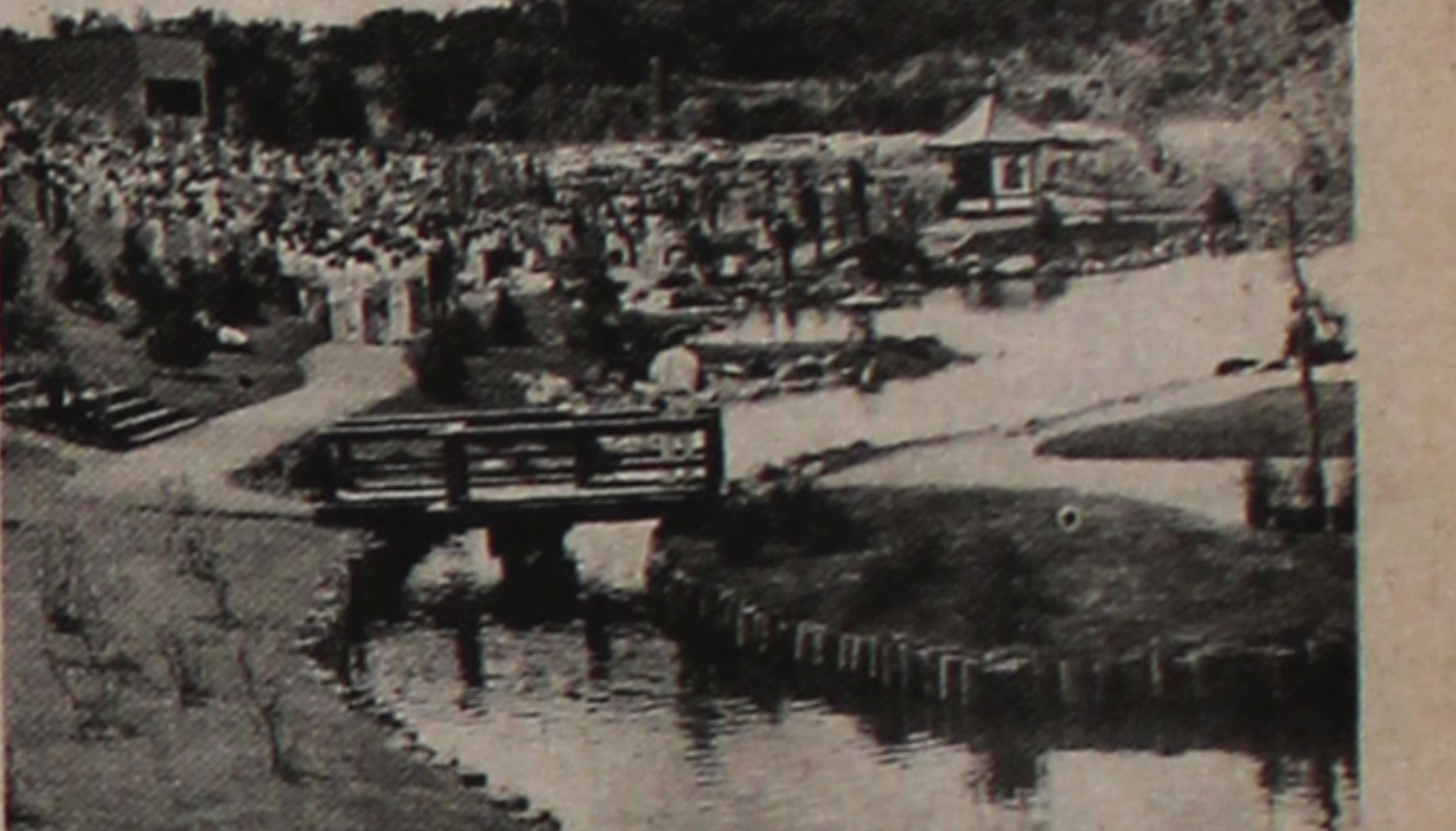
The Japanese Garden at Normandale Jr. College near Minneapolis is dedicated during the MIS Veterans Reunion July 18. Funds for the Bentendo shrine and connecting bridge came from MIS Veterans and friends.