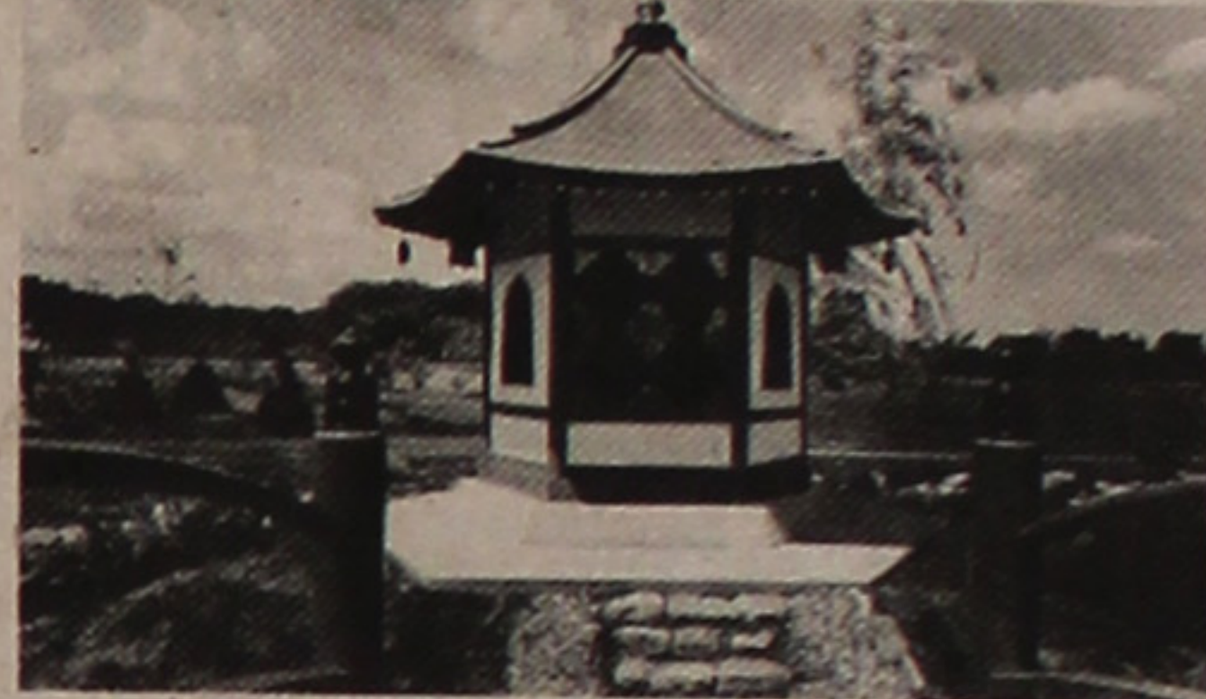
The Bentendo—a Gift from MIS Graduates

The Normandale Japanese Garden thanks you. The Bloomington Affiliated Garden Clubs thank you. And the MIS Fund for Normandale Japanese Garden, Minneapolis, Minnesota, thanks you.