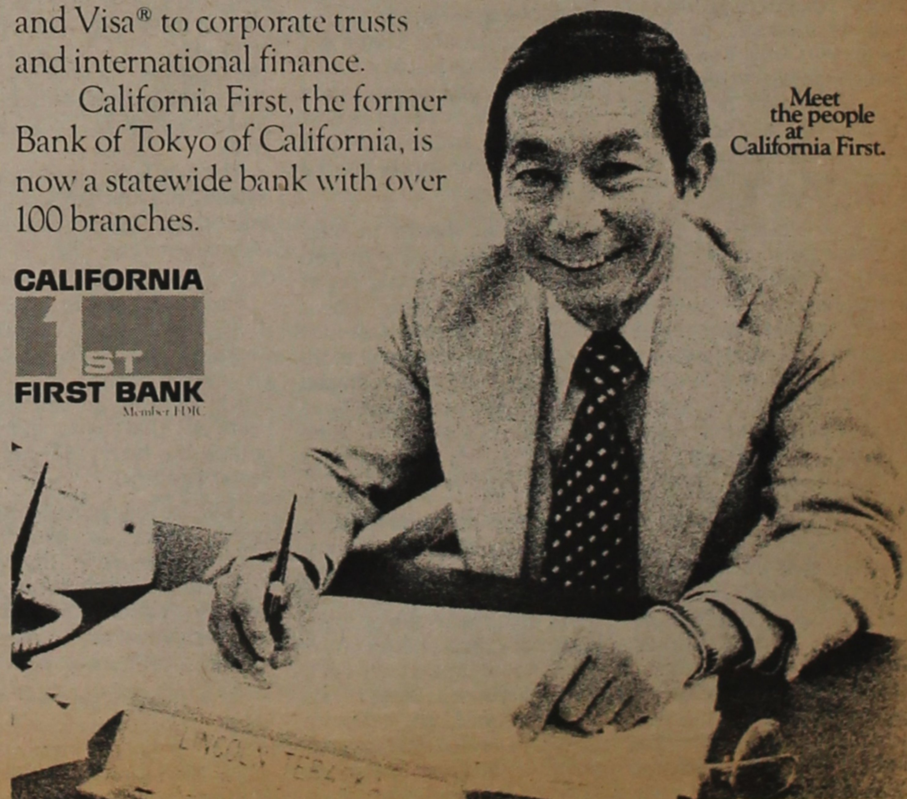
Meet the people at California First.