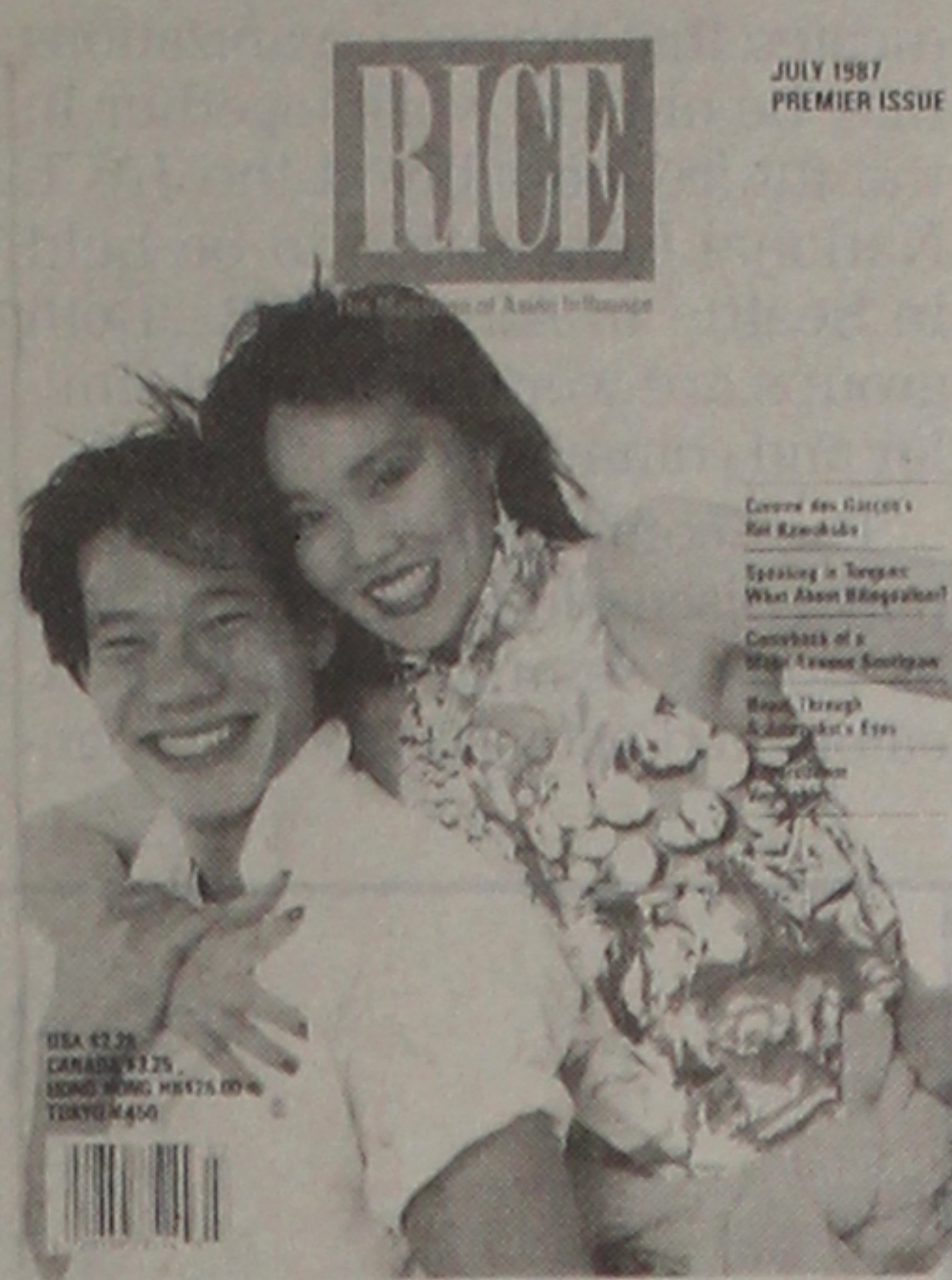
The cover of Rice's first issue.

According to Jann, who racked up 10 years of experience publishing Jade before deciding to fold, it is difficult to portray a general image of Asians in a photo