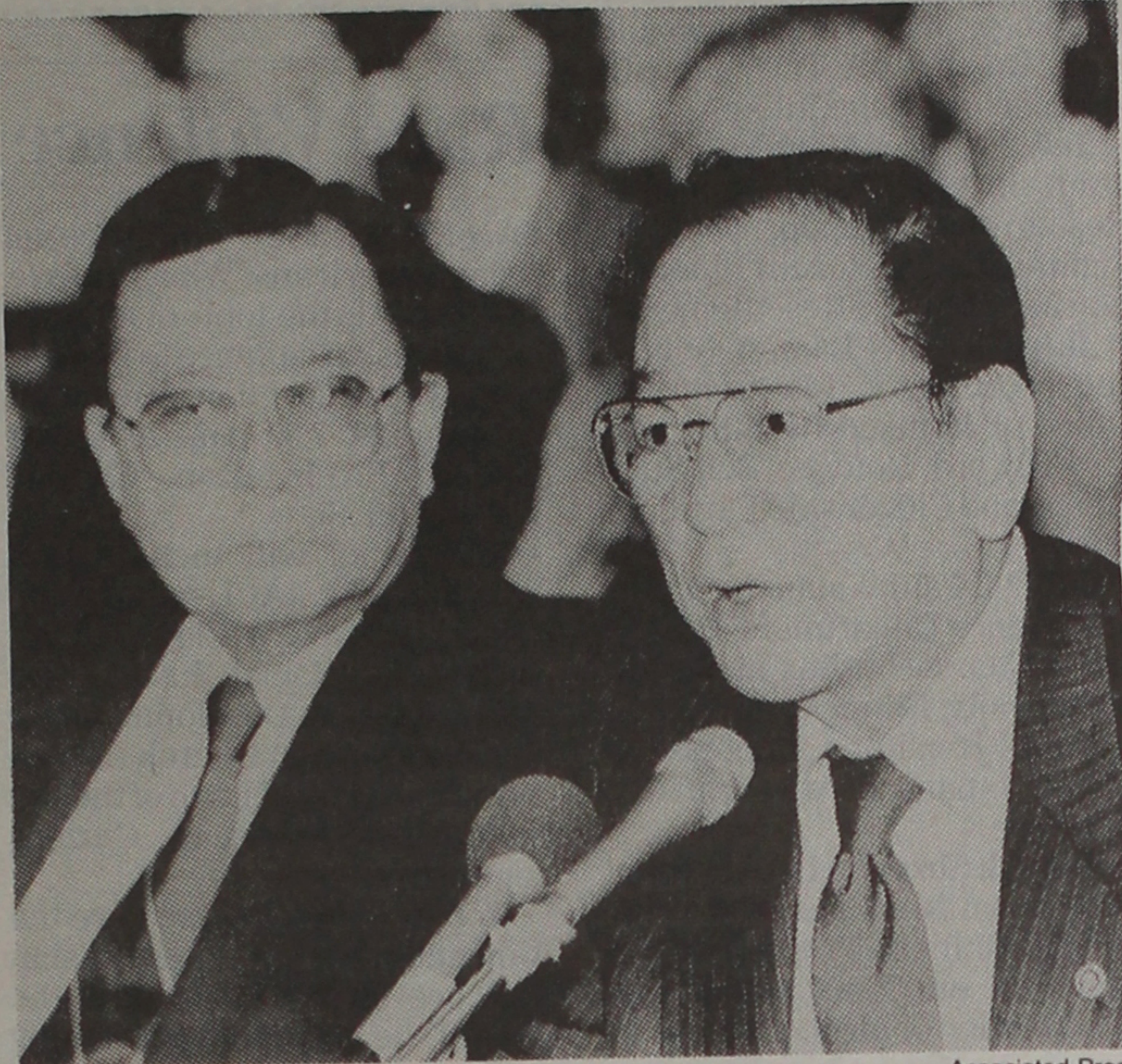
Sens. Daniel Inouye (left) and Spark Matsunaga at hearing on redress.