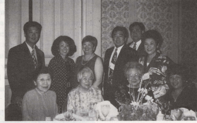
products until the infamous poster comes down. There is an ObaChine in Santa Monica, however, not the

tion and verbal or physical abuse. (Honolulu)