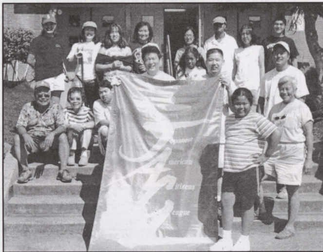
Seattle JACLers gather at Aki Kurose Middle School Academy for, "A Day of Beautification."