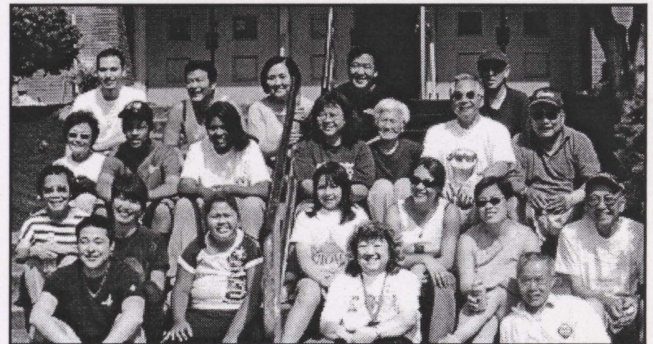
Volunteers at Aki Kurose Middle School Academy.