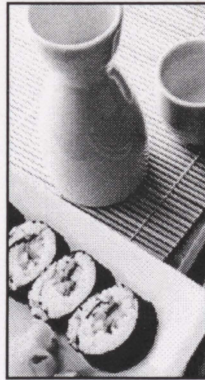
Sushi and sake.

The Japanese American Chamber of Commerce is pleased to announce that it will again host a sumptuous Sushi & Sake Fest to be held from 5:00 to 8:30 PM on Wednesday, October 29 at the Grand Hyatt Hotel in downtown Seattle, 721 Pine St. The event drew raves from many of the 1,000 people who attended the festival last year, not only for the opportunity to taste the best sushi and sake in town, but also for the way it was presented.