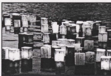
Lanterns on lake.

Hundreds of lanterns were afloat on Green Lake to commemorate the 58th anniversary of the atomic bombing of Hiroshima and Nagasaki, part of Seattle's From Hiroshima to Hope event, held the evening of August 6,