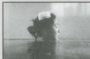
Cover from Sento at Sixth and Main.

Sento at Sixth and Main – the title of a book about Japanese American communities and the cultural unfolding that