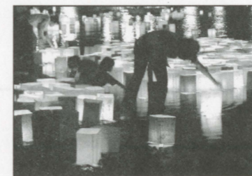
Lanterns afloat on Greenlake.

It is not too early to volunteer for the next From Hiroshima to Hope event. Would you like to help with this Seattle JACL sponsored event? We especially need people to help collect the lanterns from off of the lake after next year's ceremony. While the lantern ceremony is a beautiful one, it usually takes at least four hours to scoop all of the lanterns off of the lake, and longer if there is a strong wind on the lake! Boats and volunteers are scattered everywhere on the lake. However, more boats and volunteers could whittle the time down. This year, the last volunteers went home well after midnight.