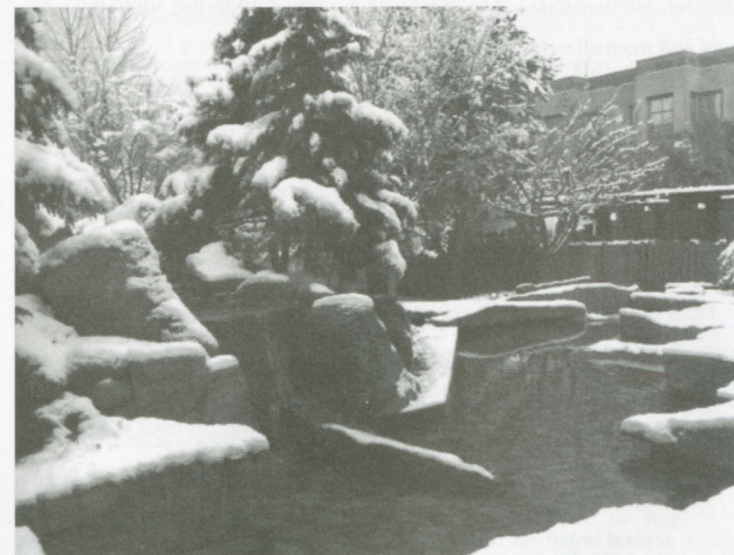
New Keiro Garden in Winter's Beauty

We miss Shigeko's vibrant presence and razor sharp recollections. We think Shigeko would be pleased to be remembered in the Keiro Garden. When the garden is dedicated, perhaps, we should toast Shigeko with her signature drink ... a shot of scotch with a water back.